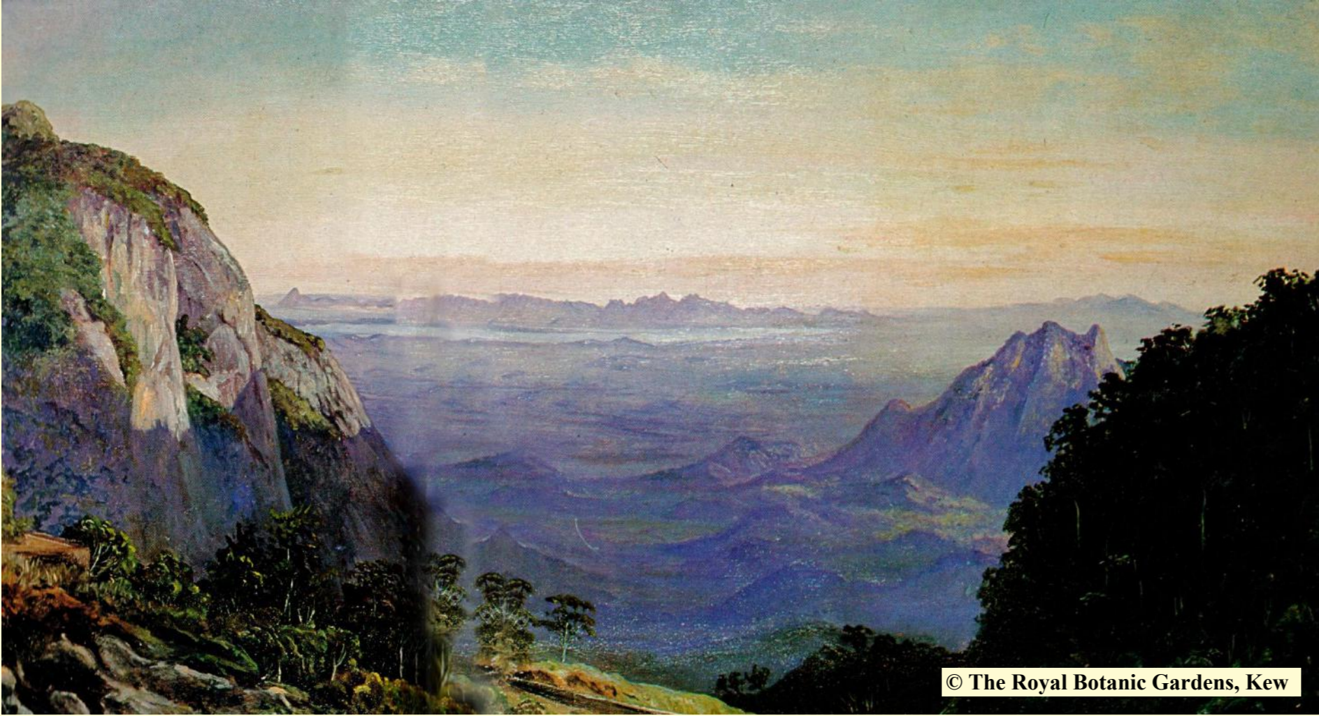
View from the Sierra of Petropolis looking towards the Bay of Rio and its islands

The Royal Mail Steam Packet Company's royal mail steam-ship Neva sailed hence at three this afternoon with the Brazilian and River Plate mails, 94 passengers, and a general cargo, including £250,000 in specie.