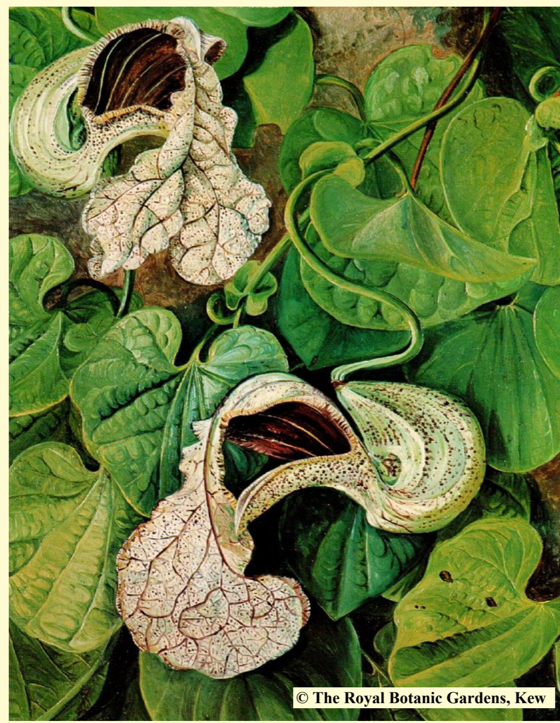
A Brazilian climbing plant which has an unpleasant smell