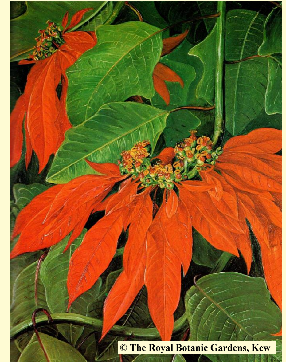
Poinsettia or Christmas Flower. Grown as a pot plant in the UK and on sale at Christmas. The cultivated variety is particularly grown for its leaves which all turn red.