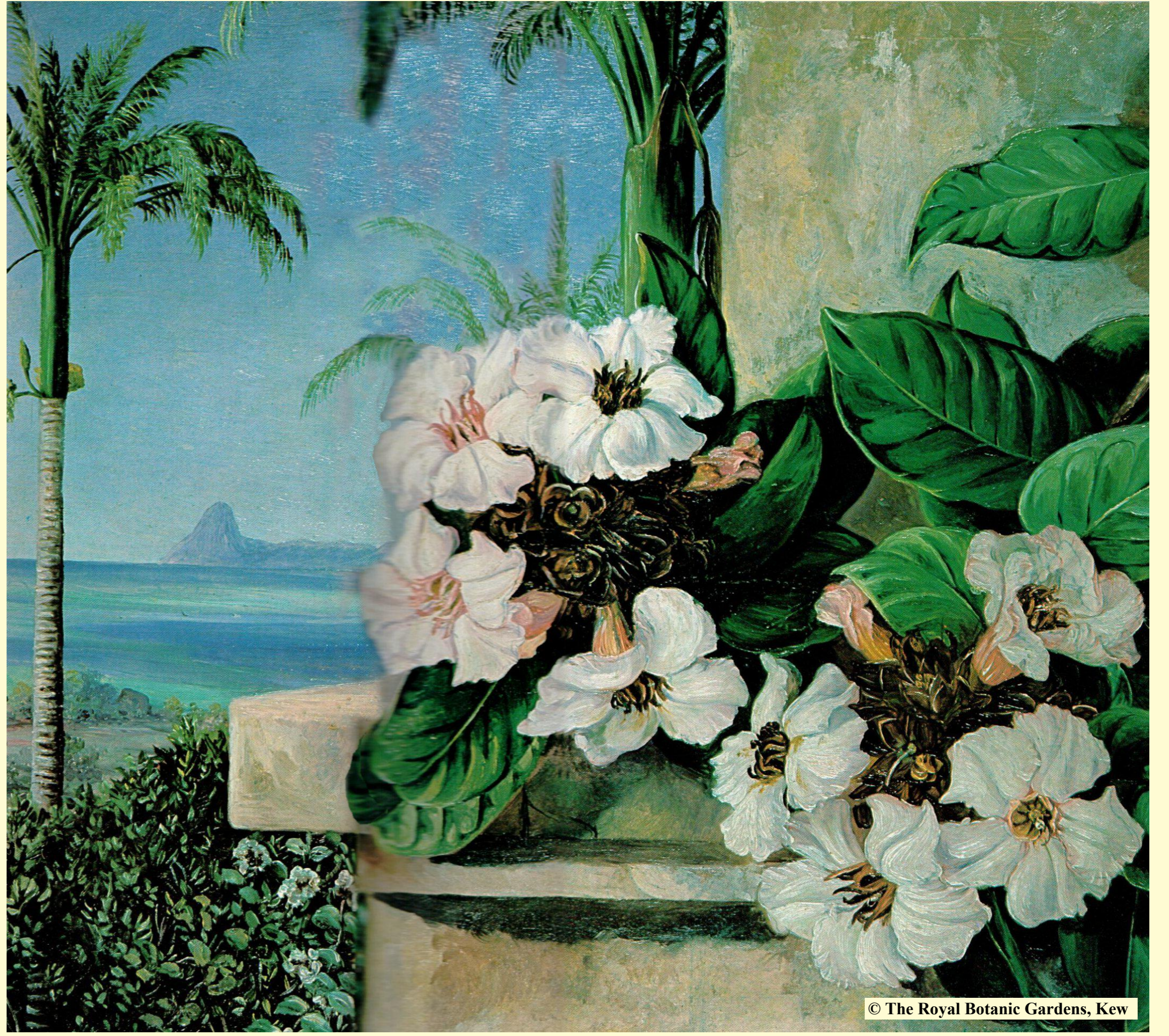
The Sugarloaf Mountain in the distant background and a climbing plant, Strophanthus gratus in the foreground. A Royal Palm stands to the left