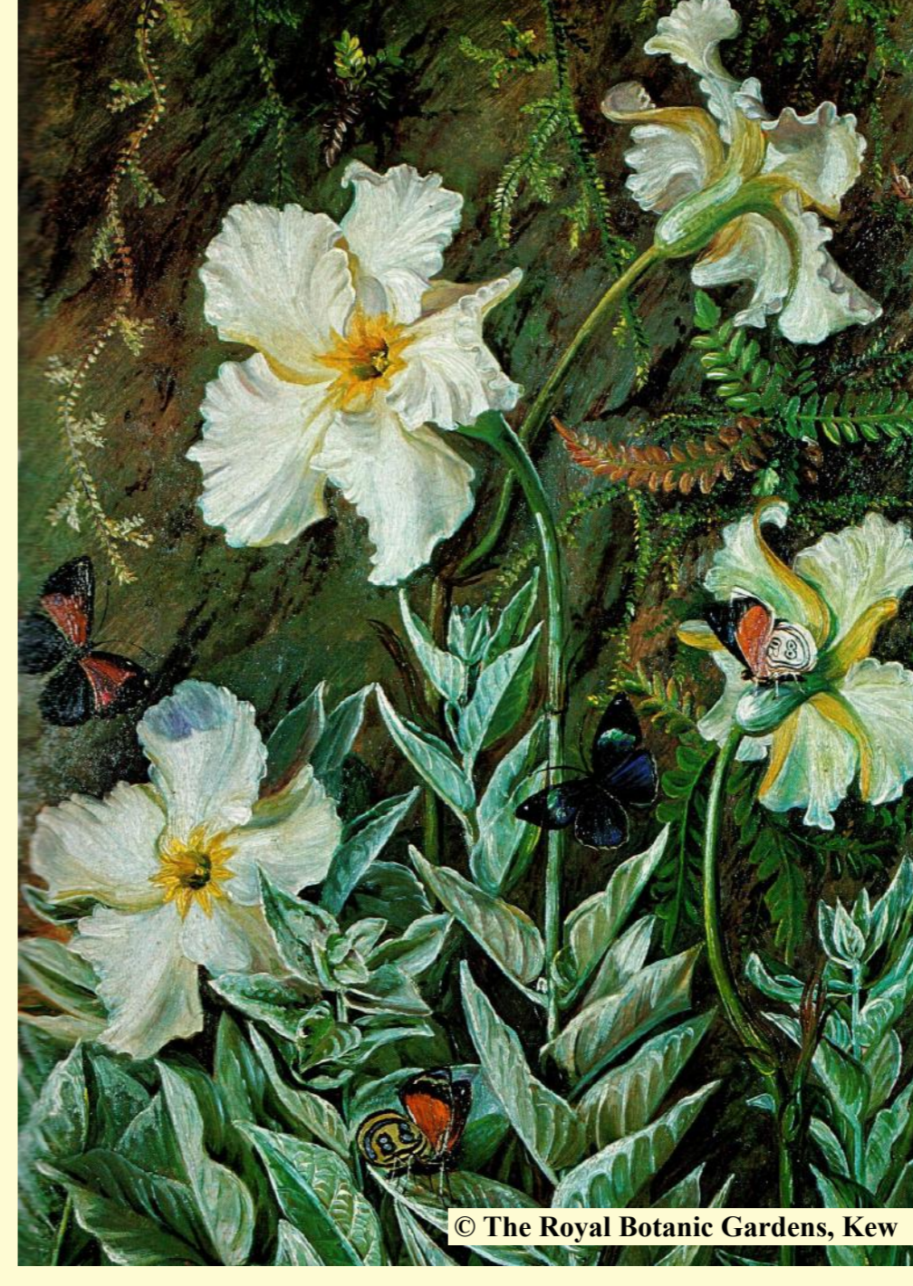
The Flannel Flower so called because of the wooly surface to some parts of the plant