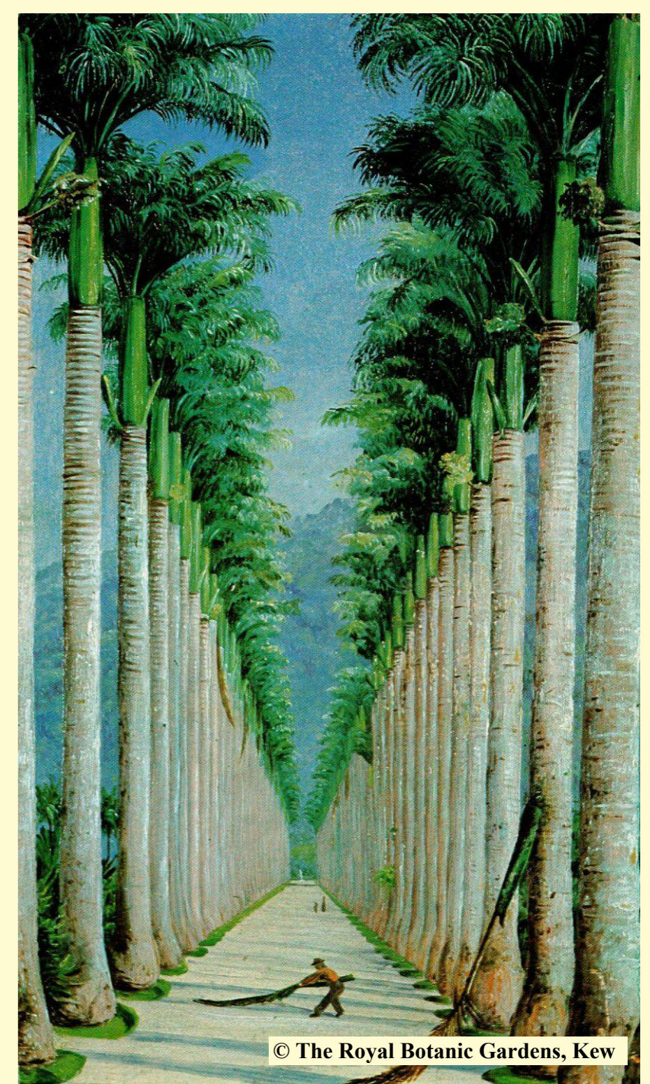
The avenue of Royal Palms at Botofogo