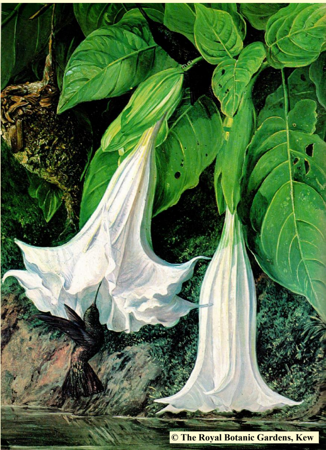
Angels Trumpet flowers and humming birds