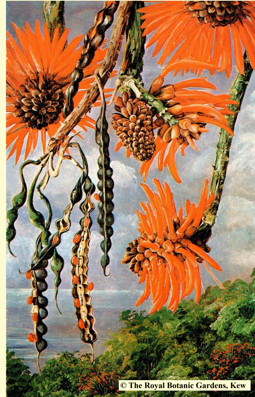
The Coral Tree in flower