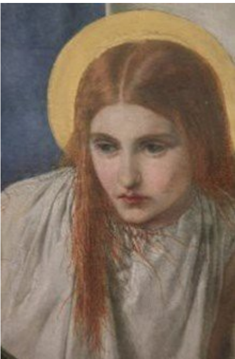
Above: D G Rossetti's depiction of the Virgin Mary in The Annunciation , for which Christina Rossetti was the model.

Wallpaper and a surprise item from 5, High Street dating from the time of D G Rossetti's visit will also be on display.